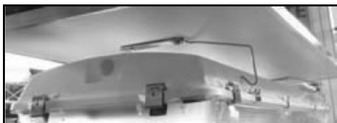
Fixed Mount Bracket using removable hooks. Catalog number: 86230 2 required per fixture