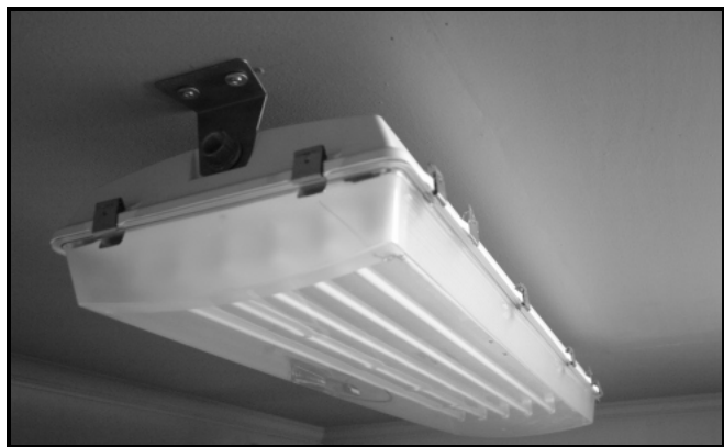
Fixed Mount Bracket Kit Catalog Number: 53115