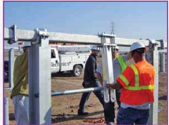
San Joaquin Solar Farm will provide the local water treatment plant with energy uninterrupted by maintenance.

Nearly 9,000 pieces were galvanized on this project, and packaging and bundling were very important to maximize full truck loads from Los Angeles to the site in central California. A critical timeline had to be followed in order to coordinate fabrication and galvanizing in L.A. and transportation to the jobsite within two months. With the quick turnaround in the galvanizing process, the galvanizer was able to deliver parts to the jobsite in a timely manner for this environmentally conscious "green" project.