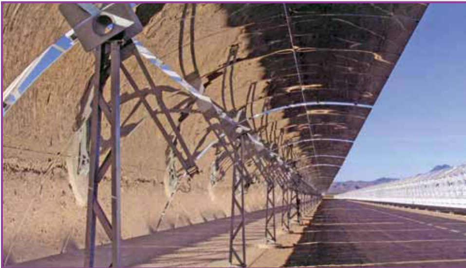
Shining beautifully, this hot-dip galvanized Nevada solar farm utilizes the intense heat and sun of the desert.

This project is a first in the United States of this size and magnitude, but larger projects are planned in Nevada and California. After the success of employing hot-dip galvanized steel in this project, it is expected that the additional plants will use galvanized steel as well. The durability and longevity provided by galvanized steel will ensure hot-dip galvanized steel will be a player in the expanding alternative energy market well into the future.