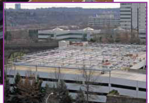
The solar roof panel system above the Johnson and Johnson building is hot-dip galvanized to withstand New England's harsh weather conditions.