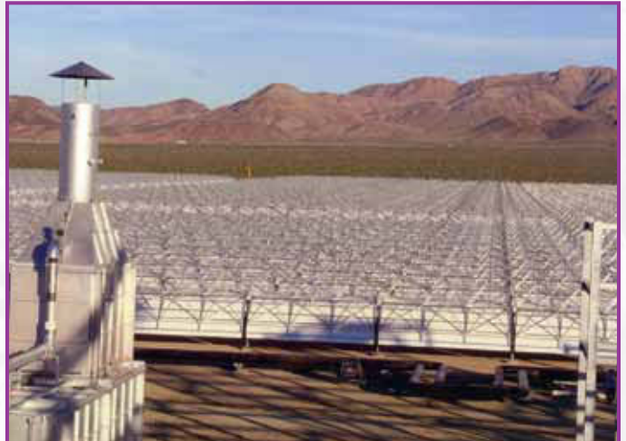
This galvanized solar energy center is the third largest in the world. It blends into the environment while harvesting renewable energy, minimizing environmental impact.

The zinc used in the hot-dip galvanized coating is a natural, healthy metal. As the 27 th most abundant element in the earth's crust, zinc is readily available and renewable in addition to being 100% recyclable, along with the steel at the end of its service life. The natural, renewable, and durable zinc of the hot-dip galvanized coating will ensure renewable solar power can be generated without interruptions or impact to the environment.