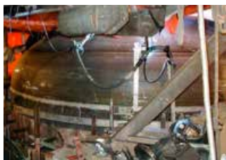
Weld overlay for build up and material upgrading

AZZ WSI is a specialized services company focused on the Energy Industry.