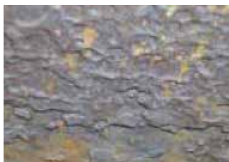
ID cladding defects, CUI, corrosion and cone erosion