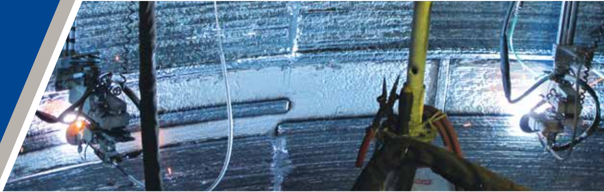
Structural reinforcement of a Delayed Coker Unit