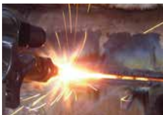
Cone and head removal, repair and reinforcement