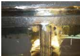
Seam crack repair and reinforcement band