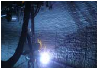
Bulge repair and structural reinforcement